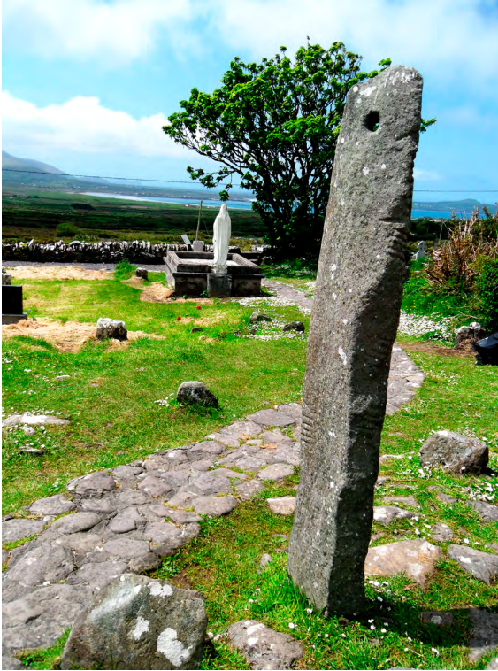
Fig. 2. Ogam stone CIIC 187 from Cill Maoilchéadar / Kilmalkedar, Co. Kerry, Ireland. The inscription reads ANM MAILE-INBIR/ MACI BROCANN 'name/soul of Máel Inbir son of Broccán.

Other types of supports (e.g. silver brooch, spindle-whorl, knife handle, comb, etc.) are extremely rare. 2 They are known from Ireland, Scotland, and Northern England and typically belong to the period of 'scholastic' productions of Ogam inscriptions in the later Old or Middle Irish periods. Unlike the bulk of Ogam inscriptions, these types of support attest to a more private outlook in writing. Early medieval narrative texts make occasional mention of the use of Ogam on wooden sticks for everyday writing purposes (McManus 1991, 157-163), but this has not so far been corroborated by archaeological finds, even though the conditions in Ireland, for instance in bogs, would be favourable to preserving such objects. It is possible that these literary passages are medieval antiquarian fictions.