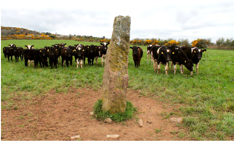
Fig. 1. Ogam stone CIIC 304 from An Chreathánach Theas / Crehanagh South, Co. Waterford, Ireland. Reading: VOCAGNI MAQI CUR[I]T “of *Fochán son of Cúrid (?)”.

However, whether this time is close to the invention of the script is disputed. From a linguistic point of view, any time between the 1 st and the 5 th century is possible (Harvey 2001; and more pronouncedly 2017, 59). The 5 th -7 th centuries are regarded as the classical phase of Ogam. Inscriptions from this period make up the so-called ‘orthodox’ Ogam corpus, as against the stones from the 8 th century and later which are called ‘scholastic’ Ogam, a phase in which the practice is no longer continued in a direct line, but is under influence from Old Irish manuscript writing (McManus 1991, 129-132). Even when Ogam had gone out of use in its primary function in Ireland, it remained a firm reference point for professionals in the poetic art throughout and long after the middle ages, as a manifestation of an original Irish intellectual culture (Poppe 2018). In Scotland and on the Isle of Man, the Ogam tradition lasted longer, until the end of the Viking period.