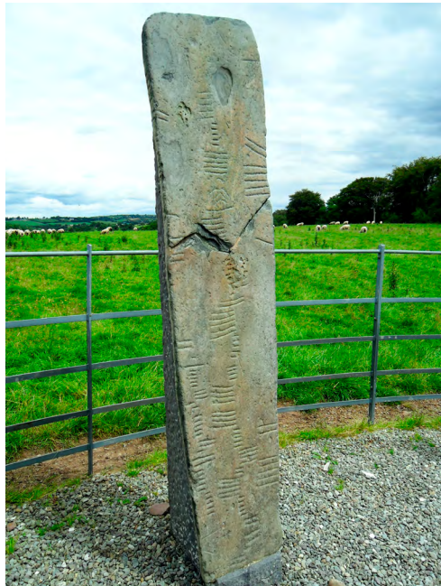
Fig. 3. Ogam stone CIIC 241 from Cill Bheanáin / Kilbonane, Co. Kerry, Ireland. Right angle: B[AID(?)]AGNĪ MAQI ADDĪLONA “of Báetán son of *Aidliu”. Left angle: NAGŪN[I(?)] M[U(?)]C[O(?)] B[AI(?)]D[A]N[I(?)] “of *Nugne (? for Mugne?) from the sept of Báetán”. Face of stone: NIR[??] MNĪ[DAGNI]ESSICONIDDALA/ AMIT BAIDAGNI (unclear).

As regards its shape, Ogam is a curious script that consists of strokes and notches engraved on the edges of objects, typically standing stones. When edges are missing, occasionally a straight line can serve as an artificial edge. As a consequence of the exposed position of the inscriptions on that part of the stone that is most vulnerable, namely the edge, very often the texts are weathered and letters are difficult to read or have been lost.